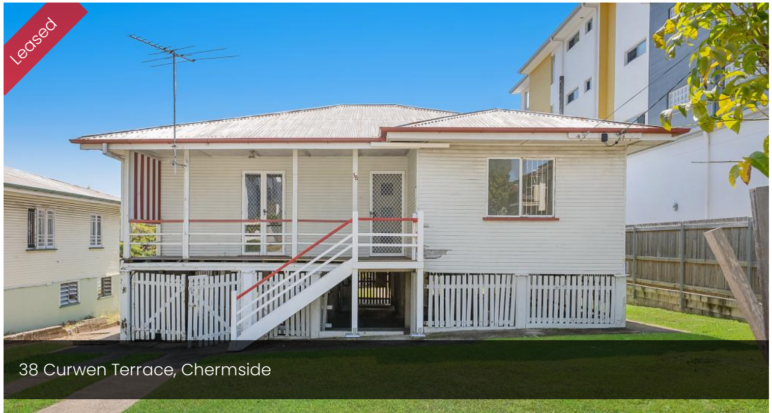
38 Curwen Terrace, Chermside