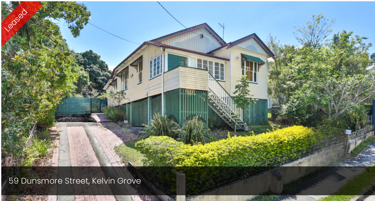
59 Dunsmore Street, Kelvin Grove